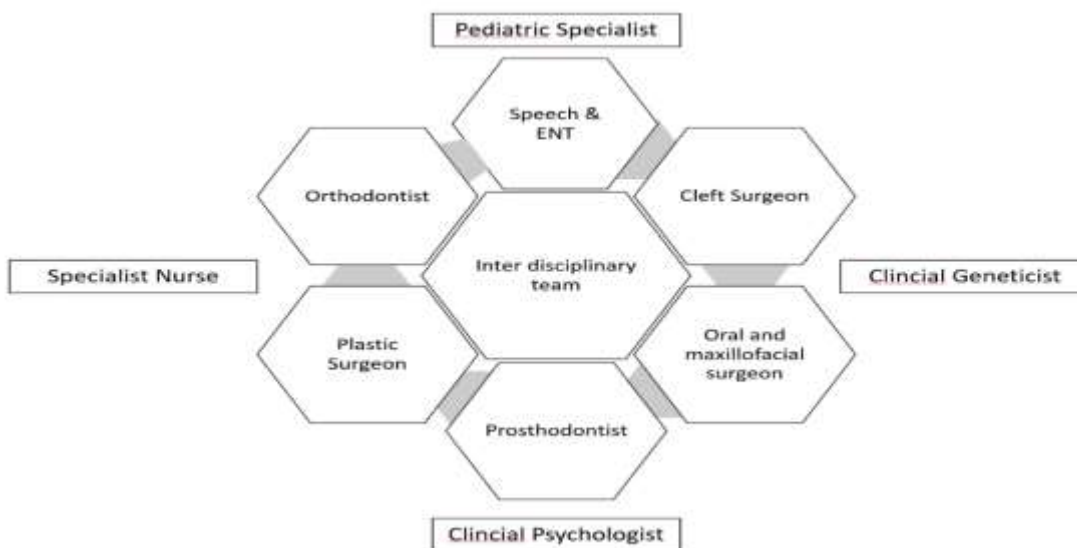
Diagrammatic representation of the interdisciplinary team for CLCP patients

The role of the orthodontist in cleft management is very essential. The orthodontists the core members of the interdisciplinary group who assist the surgeon at all stages of reconstructive care