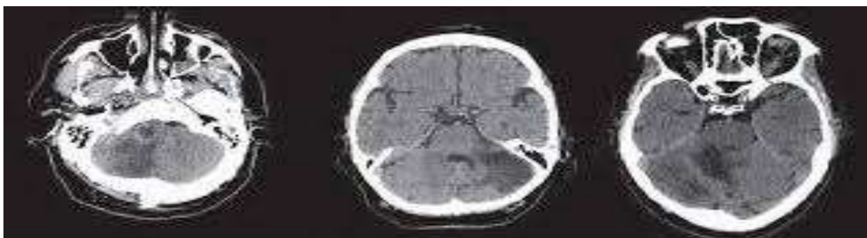
Fig 2. Acute stroke with Covid 19.

Encephalopathy is a pathobiological process in the brain that usually develops over hours to days and can manifest as changed personality, behaviour, cognition, or consciousness (including clinical presentations of delirium or coma) [11]. The largest study to date, [12] from Wuhan, China, retrospectively described 214 patients with COVID-19, of whom 53 (25%) had CNS symptoms, including dizziness (36 [17%] patients), headache (28 [13%]), and impaired consciousness (16 [7%]). 27 (51%) of the patients with CNS symptoms had severe respiratory disease, but there was little further detail. In a French series of 58 intensive care patients with COVID-19, 49 (84%) had neurological complications, including 40 (69%) with encephalopathy and 39 (67%) with corticospinal tract signs [13]. MRI in 13 patients showed leptomeningeal enhancement for eight and acute ischaemic change for two; CSF examination for seven patients showed no pleiocytosis. 15 (33%) of 45 patients who had been discharged had a dysexecutive syndrome. Additionally, some case reports have appeared, including a woman with encephalopathy with imaging changes consistent with acute necrotising encephalopathy [14] and a fatal case in which viral particles were found in endothelial cells and neural tissue, although there was no indication of whether this was associated with inflammation [15].