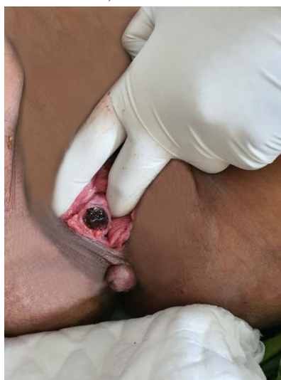
Figure 2. Mass in the vagina after the first cycle of EMACO chemotherapy

an ultrasound examination of the whole abdomen showed that the uterus was enlarged and anteflexed with a uterine size of 18x20 cm according to the gestational age of 20 weeks; a multilocular cystic mass appeared in the adnexal area with the impression of a lutein cyst; a heterogeneous mass appeared in the uterine cavity with multiple anechoic areas, giving a Honeycomb appearance; no gestational sac was seen, and intact myometrium was indicative of a hydatidiform mole. The examination result was a hydatidiform mole, and no metastatic lesions were seen in intra-abdominal organs.