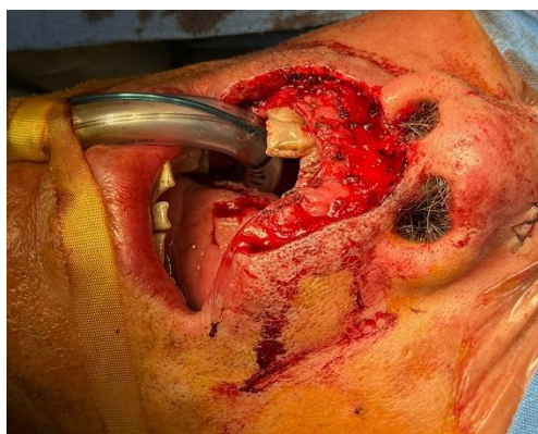
Figure 2. Preoperative image

be necessary. The lip tissue comprises the epidermis, muscular layer, vermilion, and oral mucosa, exhibiting a distinctive structure not commonly found in other body regions. Consequently, utilizing adjacent lip tissues for lip reconstruction is appropriate. If the lesion encompasses over 35% of the lip, flap reconstruction is imperative, necessitating consideration of adjacent regions, including the unaffected lip (Abbe type), cheek (Gilles or Estlander type), and chin (Bernard type).