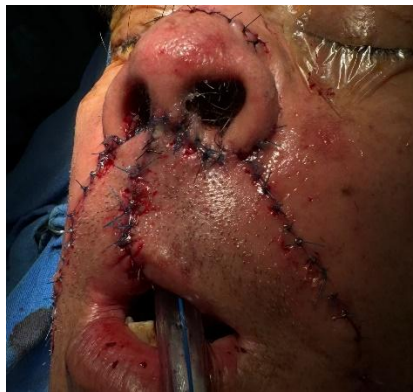
Figure 3. Postoperative image

mouth's corner was the optimal choice. Furthermore, the Abbe technique is inappropriate for the corners of the mouth. Given these factors, the Karapandzic flap technique was determined to be the most appropriate for the current case. The intact contralateral corner of the mouth serves as the basis for comparison. Regardless of the chosen lip reconstruction technique, asymmetry at the corners of the mouth will manifest. Insufficient muscle reconstruction, when the shape of the mouth is emphasized, can cause dispersion and numbness at the corners of the mouth, diminishing the effectiveness of the reconstruction. In our case, the corners of the mouth were preserved in an optimal position, and the progression was favorable with no complications, such as castration.