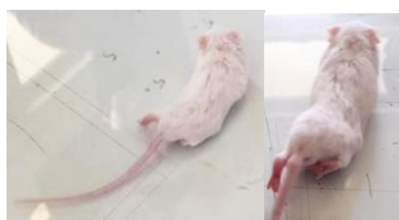
Figure 2: The mice feel pain visibly through writhing movements.

For this study, we will use the writhing reflex method, where the results of this study are the frequency of the number of writhing mice observed and counted after 5 minutes of 0.6% acetic acid induction intraperitoneally observed for 30 minutes with an observation interval of every 5 minutes. In analgesic testing this time using the writhing reflex method because this method is quite sensitive in assessing the pain stimuli given. Acetic acid is an irritant that can damage tissues locally, which can cause a pain response in the abdominal cavity with intraperitoneal administration [11]. Acetic acid 0.6% provides a fairly good pain stimulus to test animals by triggering a local inflammatory response resulting from the release of free arachidonic acid from phospholipid tissue through cyclooxygenase (COX) and prostaglandin biosynthesis. The response of mice that can be assessed in the form of abdominal contractions until they touch the bottom of the floor/stand and the mice's legs are pulled back and forth which can be seen in Figure 2.