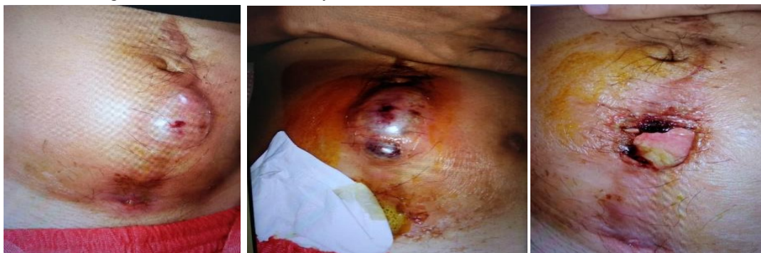
Figure 1. Fistulous opening over the scar of a previous laparotomy done 7 months back

function, blood sugar, and electrolytes were within normal limits. Chest X-ray examination showed active pulmonary tuberculosis ( figure 2a ). Patient underwent abdominal CT with contrast, the results showed localized ileus with sentinel loop; multiple mesenterial and para-aortic lymphadenopathy suggestive intestinal tuberculosis ( figure 2b ). Based on these results, patient was consulted to the digestive surgery department and decided for conservative management, fistula wound care, and re-hecting if the fistule is no longer active.