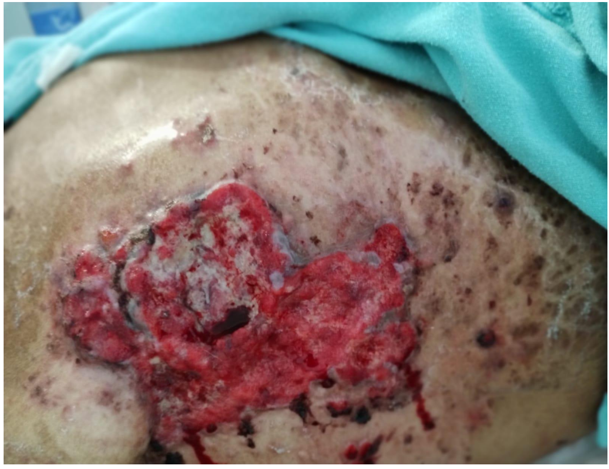
Figure 1. An ulcer was observed in the right hemithorax approximately at the level of the fifth intercostal space between the clavicular and anterior axillary midline, with atypical characteristics, with satellite lesions and indurated borders, with extensive neovascularization without evidence of active infection.

As there was a suspicious lesion on computed tomography, as well as an ulcer of atypical characteristics and evolution, it was decided to perform a biopsy of the ulcer and nodular lesions, which resulted in poorly differentiated invasive adenocarcinoma (Figures 1 and 2).