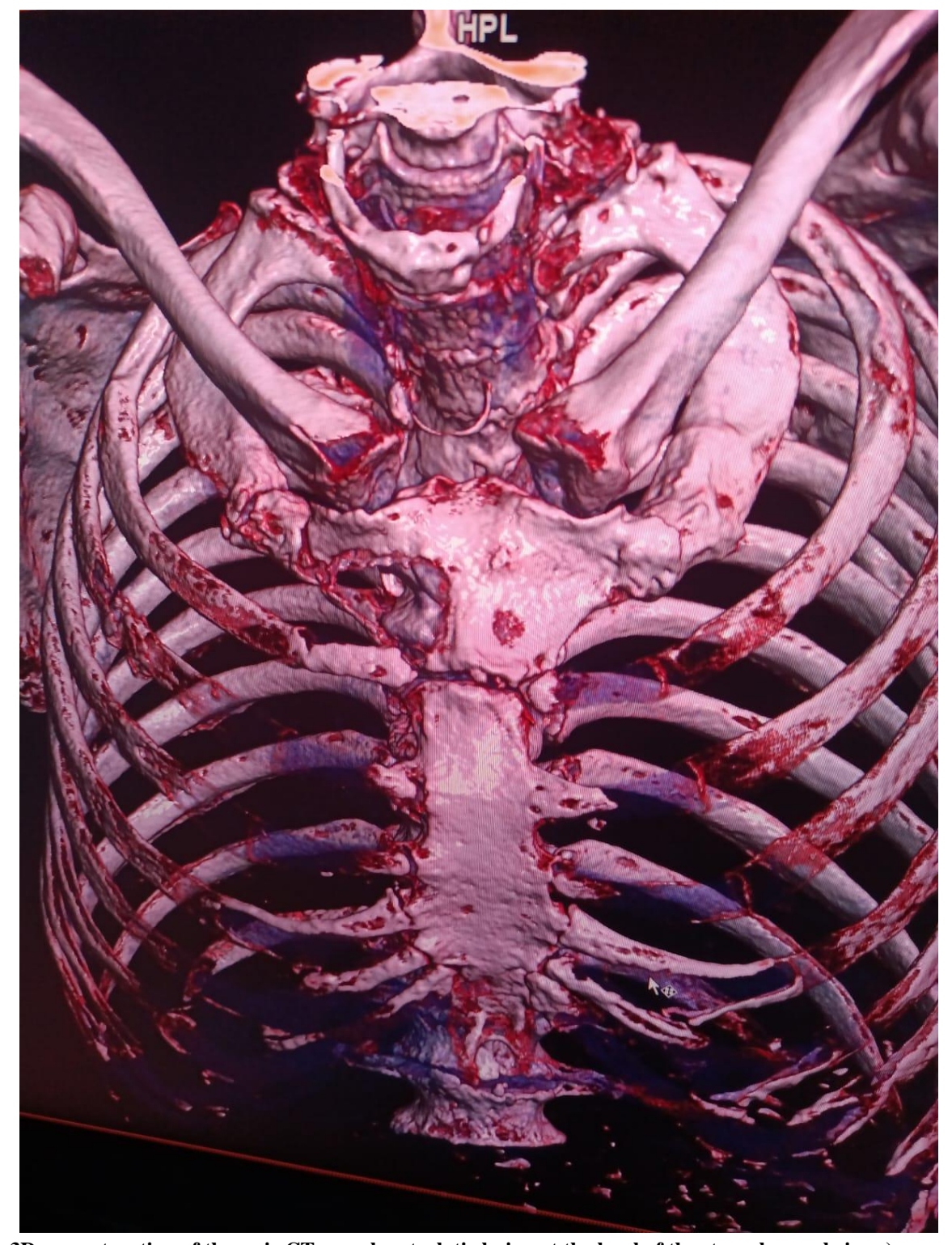
(Figure 2. 3D reconstruction of thoracic CT reveals osteolytic lesion at the level of the sternal manubrium.)

Immunohistochemical staining was positive for estrogen and progesterone receptors, as well as for CK19, with negativity to CK7 and CK20 (Figure 3.)