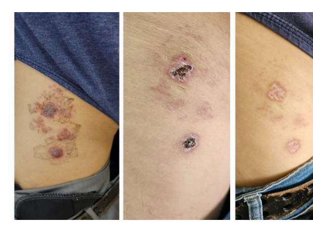
Image 3. Dorsum of left buttock, week 1-3 from left to right.

After four weeks of azole-based treatment, a favorable response was observed (Image 4), with reduction in initial symptoms, manifesting slight residual neuropathy secondary