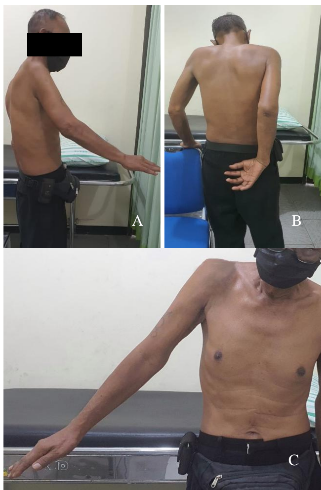
Figure 1. The patient presented with limitation of a) anterior flexion, b) internal rotation, and c) shoulder abduction of the right shoulder