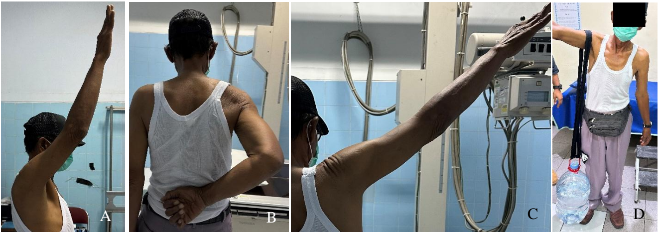
Figure 3. On 2 years follow up, the patient scored 94 on the Constant Murley score and demonstrated excellent a) anterior flexion, b) internal rotation, c) abduction of the right shoulder and d) excellent power with weight applied on the right shoulder